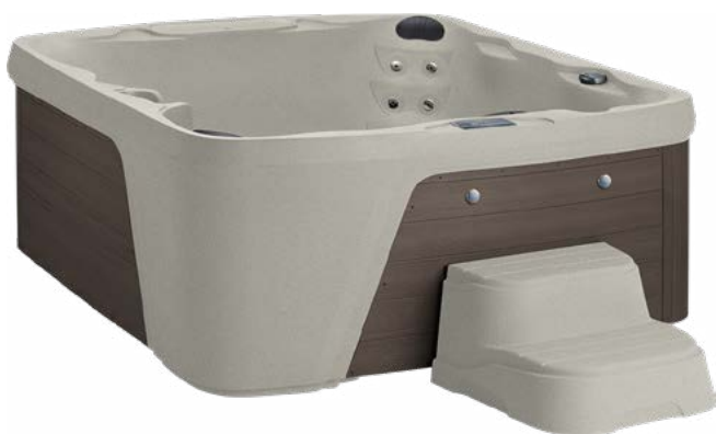
Monterey Premier shown in Sand / Brown with built-in ice bucket