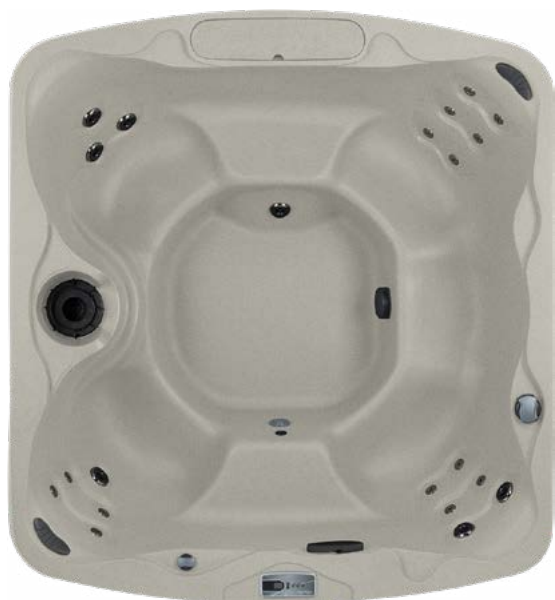
Monterey Premier shown in Sand